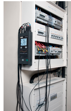
Power and Energy Logger with harmonic measurement capability