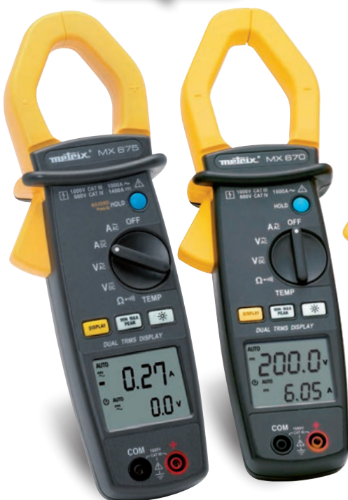
MX 675 & MX 670