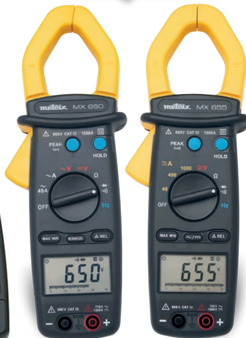
MX 655 & MX 650